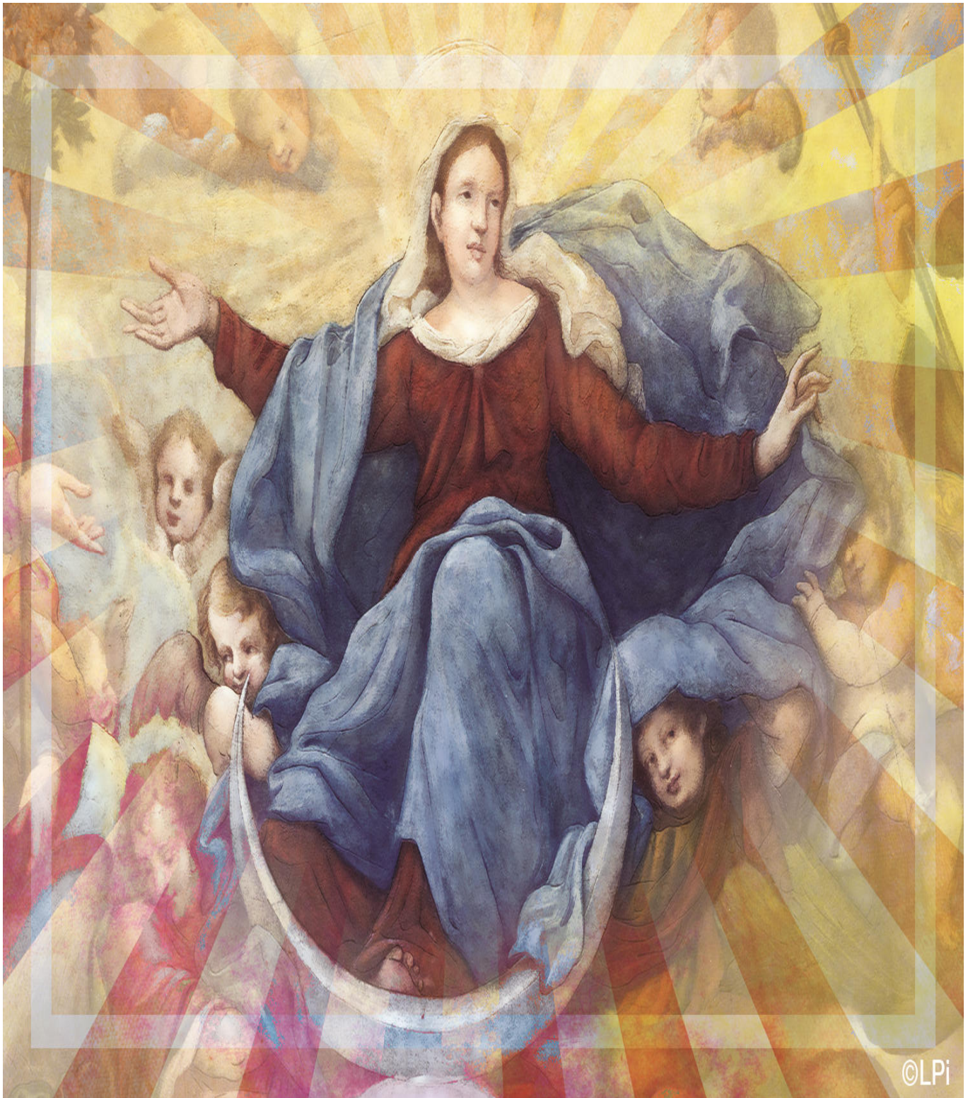
Assumption of Mary