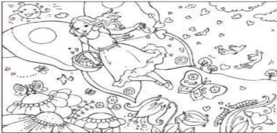
Find the differences